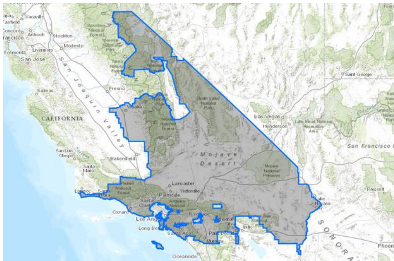
SCE service area map

The Desert Tortoise Council announces a request for proposals (RFP) for research projects targeted at developing innovations or methods designed to improve desert tortoise habitat restoration techniques. An award of $9,000 is available for the research project. The project must be one year in duration and conducted in the Mojave Desert within the Southern California Edison (SCE) service area (see attached map). Applicants should submit the attached grant request cover form and include a proposal that includes a project description, a detailed budget, professional references, and resumes of key project participants (see checklist). Appropriate projects include, but are not limited to, removal of Shismus and Bromus grasses, restoration of native forbs and grasses, research on diet use and type by desert tortoises, or other efforts related to improvements or restoration of desert tortoise foraging habitat. The project should be implemented over the 2020-21 winter growing season. A report of research outcomes must be submitted to the Desert Tortoise Council within 30 days following conclusion of the project. The application window begins on July 1, 2020 and proposals must be received (PDF to grants@deserttortoise.org ) by August 15, 2020.