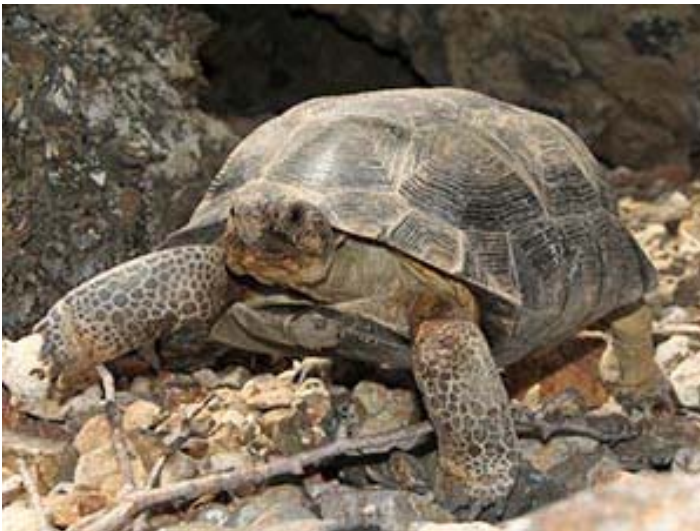
Morafka's Desert Tortoise ( Gopherus morafkai )

Abstract: We investigate a cornucopia of problems associated with the identity of the desert tortoise, Gopherus agassizii (Cooper). The date of publication is found to be 1861, rather than 1863. Only one of the three original cotypes exists, and it is designated as the lectotype of the species. Another cotype is found to have been destroyed in the 1906 San Francisco earthquake and subsequent fire. The third is lost. The lectotype is genetically confirmed to be from California, and not Arizona, USA as sometimes reported. Maternally, the holotype of G. leptocephalus (Ottley & Velázquez Solís. 1989) from the Cape Region of Baja California Sur, Mexico is also from the Mojavian population of the desert tortoise, and not from Tiburon Island, Sonora, Mexico as previously proposed. A suite of characters serve to diagnose tortoises west and north of the Colorado River, the Mojavian population, from those east and south of the river in Arizona, USA, and Sonora and Sinaloa,