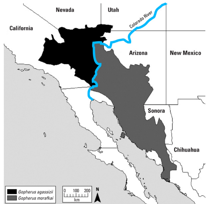
Range map of the two desert tortoise species. Adapted from Figure 2 of Murphy et al. 2011.

USGS studies on the roles of tortoises in the natural desert landscape will help inform the landscape and species management efforts of government agencies.